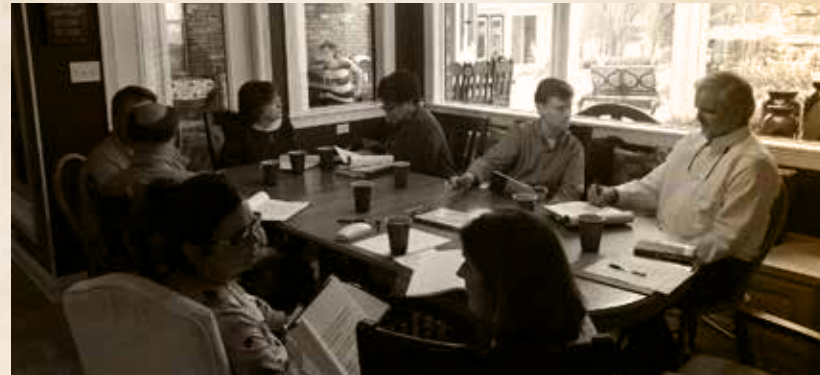
Heart of Hope Board working hard!